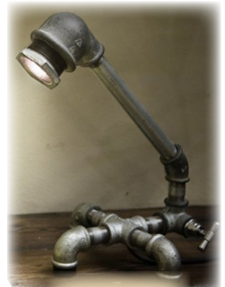
Lamp Made from Pipes