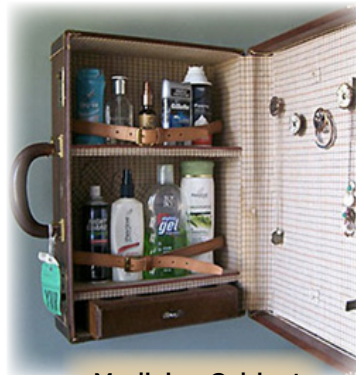
Medicine Cabinet from a Suitcase

Antique stores can be great fun to stroll through in an afternoon. One of the great things you can do while visiting your favorite antique store is to look for old things to repurpose. Repurposing keeps things out of the landfill and gives items a new life. Here are a few fun ideas to inspire creativity.