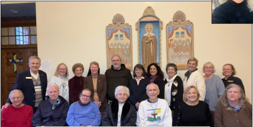
San Luis Rey Fraternity of Secular Franciscans