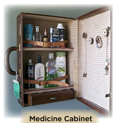
from a Suitcase

Antique stores can be great fun to stroll through in an afternoon. One of the great things you can do while visiting your favorite antique store is to look for old things to repurpose. Repurposing keeps things out of the landfill and gives items a new life. Here are a few fun ideas to inspire creativity.